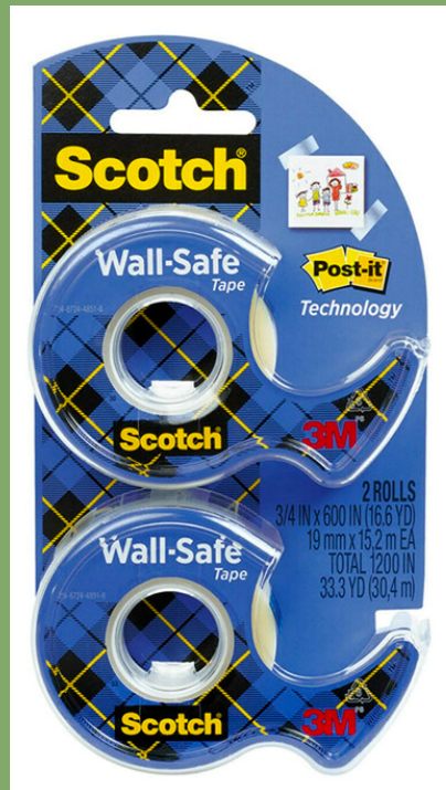
Wall Safe Tape