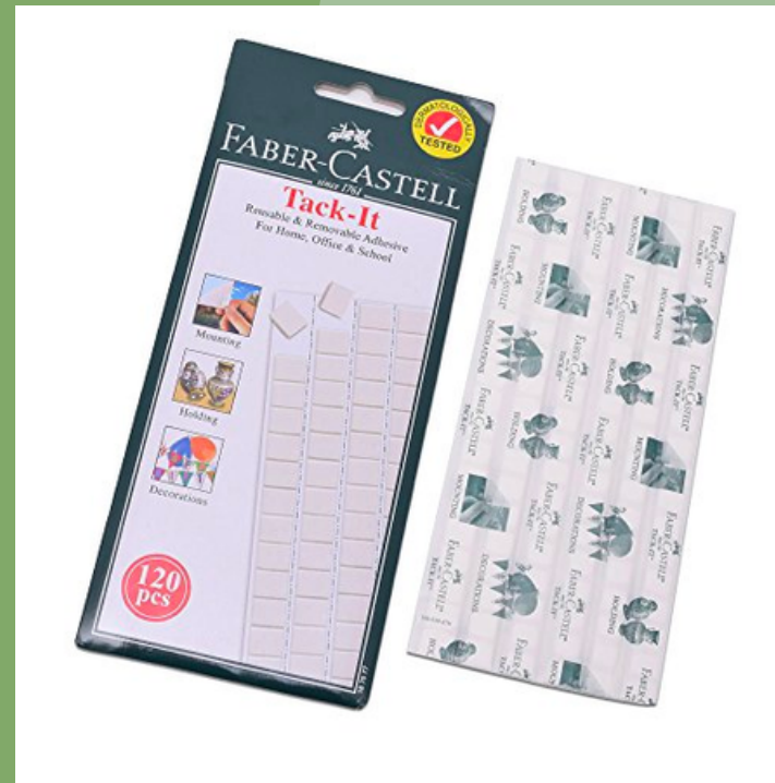
White Blu Tack

Kindly only use the said items above as it has been approved by our team in order to reduce damage caused by different adhesives.